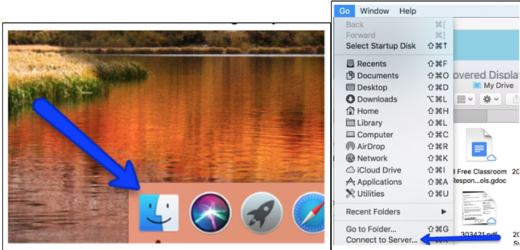
Fig 1 - Connect to a server option